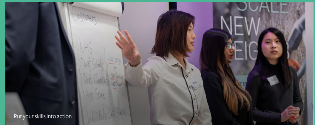
Put your skills into action

We can help you explore your options further through a range of opportunities, some of which are offered exclusively for University of Southampton students. Use MyCareer (see p7) to find out more about UoS Internships, Student Innovation Projects and Year in Employment Placements (see p14-17) which can help you gain experience of job sectors and roles which interest you. If you are looking for inspiration or individual support, then apply for a mentor through the Career Mentoring Programme (see p21) or take advantage of our individual career guidance appointments, booked through the Drop-in Service (see p8). Explore our Design Your Future workshops and webinars (see p10) and additional opportunities for enhancing your entrepreneurial skills (see p11).