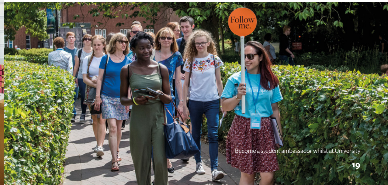
Become a student ambassador whilst at University

➤ For more information about finding and applying for opportunities, please visit www.southampton.ac.uk/part-time-work