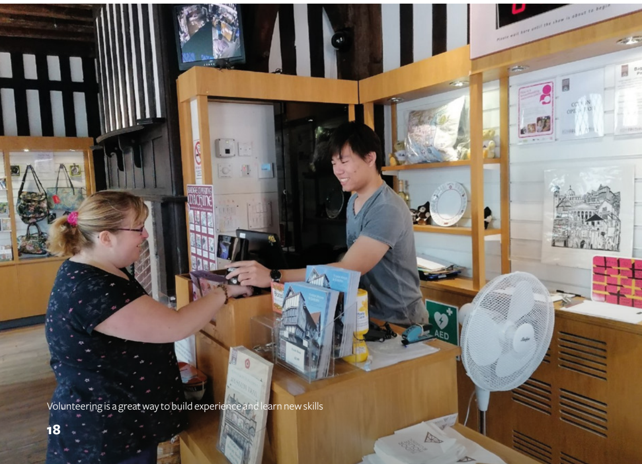
Volunteering is a great way to build experience and learn new skills

➤ Find out more: www.southampton.ac.uk/careers/volunteering