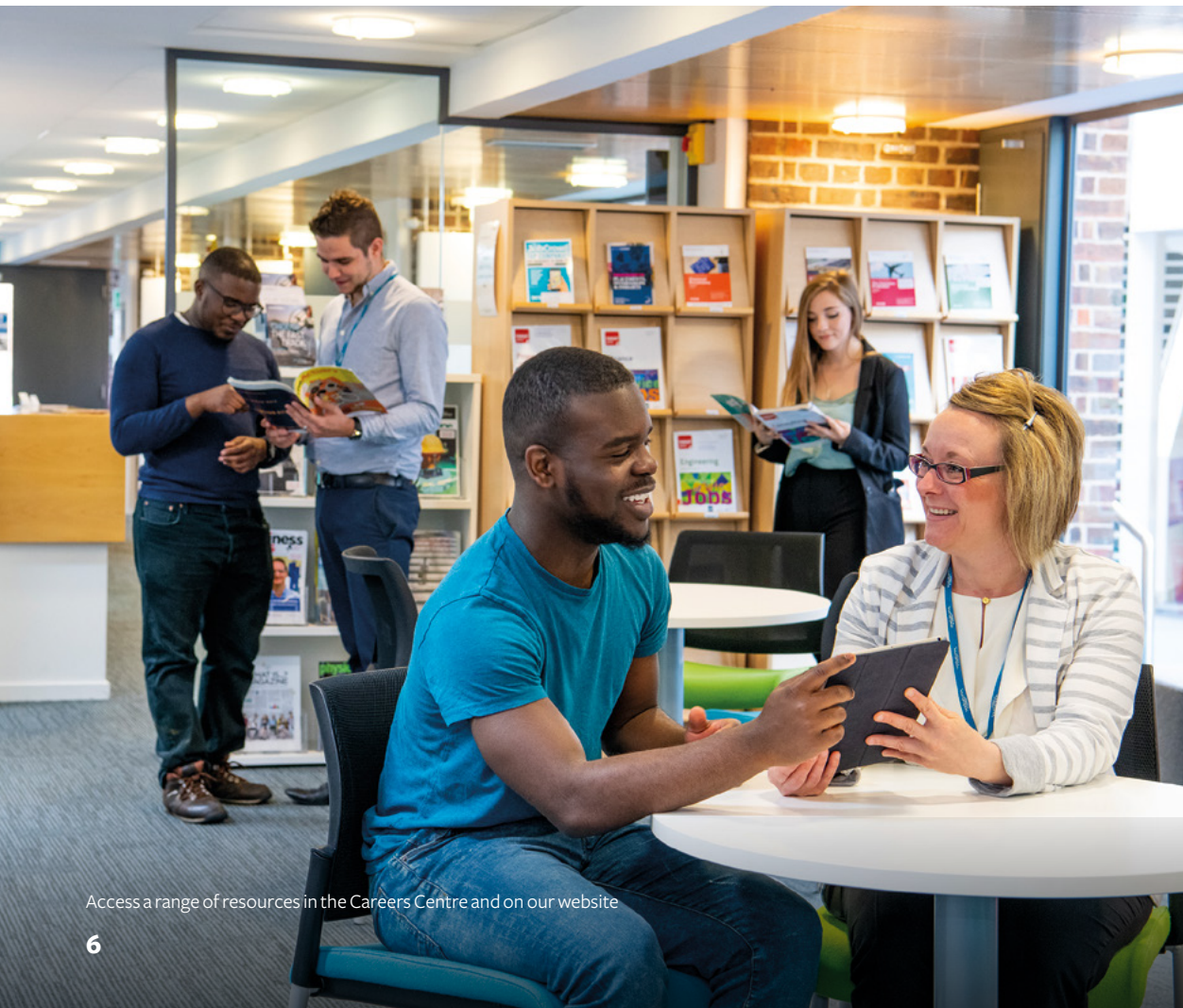
Access a range of resources in the Careers Centre and on our website

➤ For more information about the resources available visit: www.southampton.ac.uk/careers-library