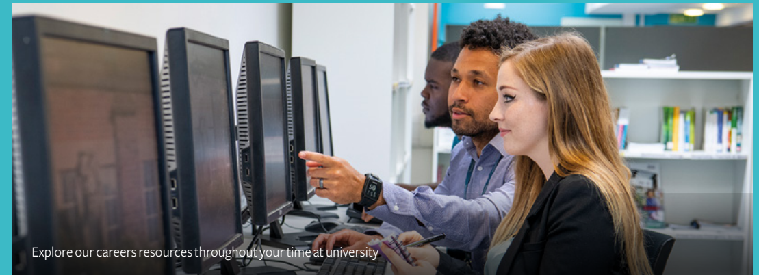
Explore our careers resources throughout your time at university

As there are so many potential career paths, it can be quite daunting to know where to start. We offer a range of ways to help you discover more about different career options. Attend one of our careers fairs (see p12) or an employer-led event (see p13) to connect with employers and learn more about specific sectors. Find out more about starting your own business from our Student Enterprise Team (see p11).